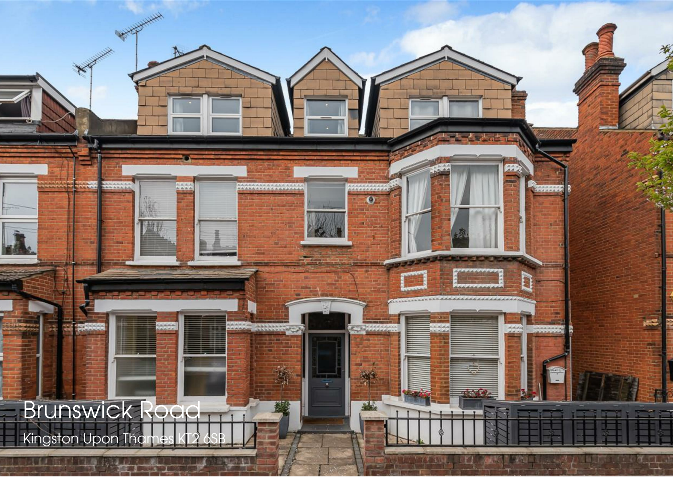
Brunswick Road Kingston Upon Thames KT2 6SB